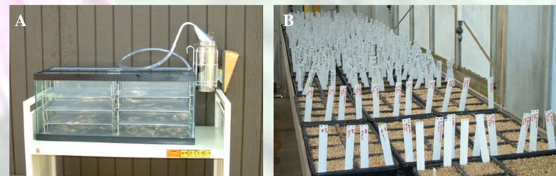
Figure 1. Smoke set-up (A) and germination trays (B).

Seeds of 10 native prairie species from the Asteraceae, Asclepiadaceae, Commelinaceae, Fabaceae, and Poaceae families and 3 Echinacea hybrids were exposed to aerosol smoke for periods of 0, 1, 10, and 60 minutes. Dried prairie vegetation was burned to generate smoke using a beekeeper's smoker (Figure 1). Smoke was pumped through a plastic hose into a 20 gallon glass container. Treatment times started when the seeds were covered with a thick, dark layer of smoke and could no longer be seen from the outside of the glass container. The hose from the smoker was over a meter long to ensure the smoke cooled before reaching the seeds.